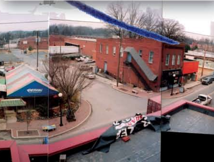
center: URBANA's approach to historic preservation shows the new corner of North Davidson and 35th Street, with the yellow Fat City building intact